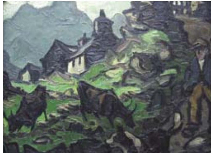
Sir Kyffin Williams RA - Welsh Hill Farmer with Cattle and Dogs, and verso of Two Boys in a Park, Circa.1960 63 x 74 cm Oil on Canvas. This painting has been framed to show both sides of the canvas.

The big question at the moment is the effect the recession is having on the art market as a whole. Art fairs have reported mixed fortunes, as have exhibitions but the art market is a resilient beast, and tends to look upon recessionary times as little more than a blip, and nothing particular to worry about. People buy paintings for all sorts of reasons – because they have a particular space on their wall, because they collect, because they look for investment, or simply because they love pictures. In recessionary times putting money into something tangible is not such a bad idea. You may or may not see a big price hike, but you will seldom lose much when you come to sell, and you just might make a profit.