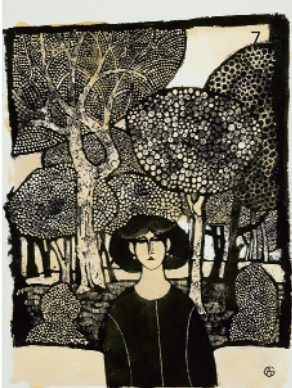
These pictures range in size from 19 x 13 cm to 28 x 19 cm and in price from £350 to £750.