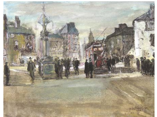
Group Series 2642 Mixed media on paper 50.8 x 40.64 cm