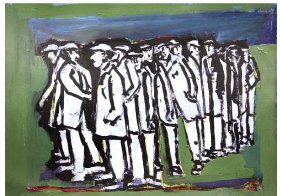
Group Series 2941 Mixed media on paper 55.88 x 76.20 cm