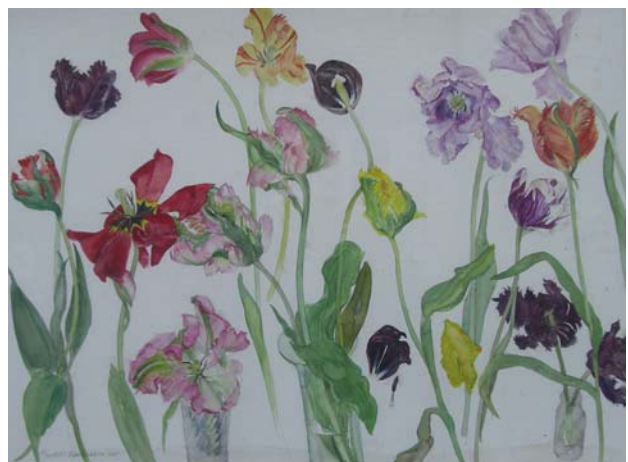
Elizabeth Blackadder Tulips 57 x 76 cm