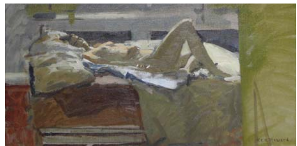
Ken Howard Florence A'Longue 04 30 x 60 cm

For more information on the scheme go to our website and click on 'paintings wanted'.