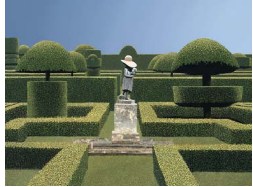
Michael Kidd The Morning After 61 x 81 cm

The 'Celebration of the English Garden' exhibition salutes the love affair the British have with their gardens. It encompasses a eclectic mix of artists and their interpretations of the quintessential English garden - hedges too!